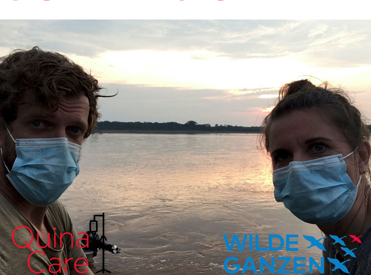
As many other countries, waiting area. The decision was

Poster used for promotion of project together with Wilde Ganzen.